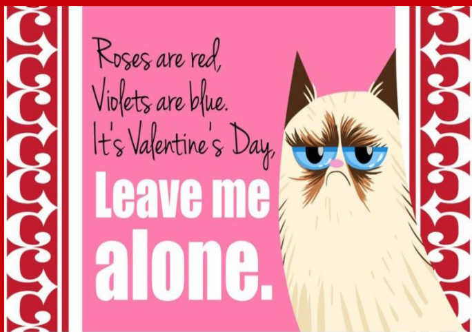
Grumpy Cat is at it again..

Beat the cream cheese until fluffy; stir in the diced strawberries, walnuts, and powdered sugar. Spoon or pipe about a teaspoon of mix into each strawberry.